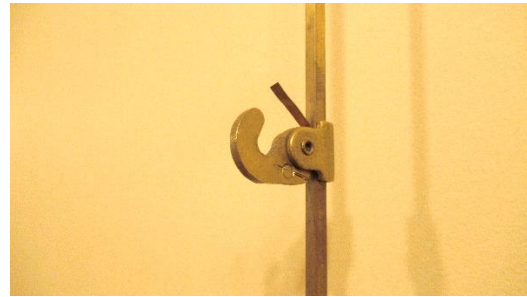
Brass & copper hook detail.