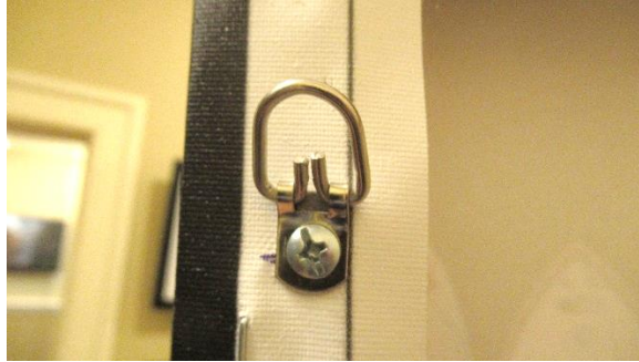
CORRECT EXAMPLE: D Hook on the back of a stretched canvas screwed into the wood on the back 1/3 of the way down from the top. Hook is pointing up.